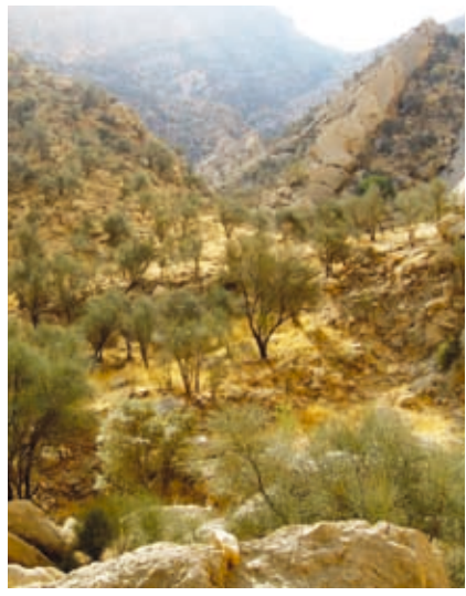
Fig. 2. Ashi Valley, Iran.

The low food availability and the high risk of poaching by local nomads have always threatened this fragile population of leopards in Bushehr Province. These problems could be solved with an appropriate conservation strategy and by upgrading Khaeez to a protected area with sufficient facilities. To understand the presence of this elusive species in this part of the country in the context